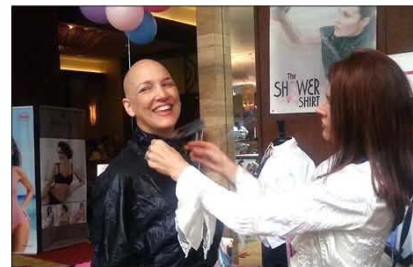
Day of Caring, Miami, Florida

The SHOWER SHIRT® Co., LLC Principle/Inventor