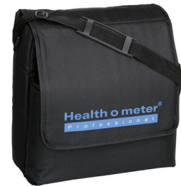
64771 Optional Carrying Case

To learn more, call 1-800-815-6615 or visit hom scales.com/752KL