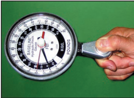
Key (lateral pinch)