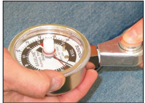
Tip (pulp pinch)