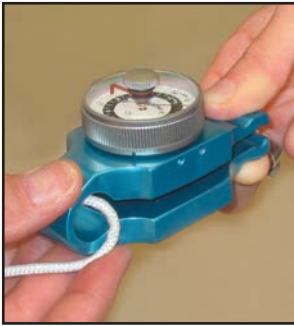
Palmer (chuck pinch)