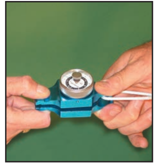
Key (lateral pinch)