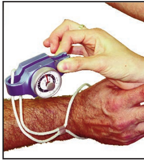
Tip (pulp pinch)