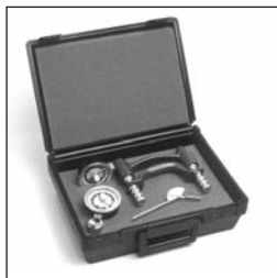
hand evaluation set